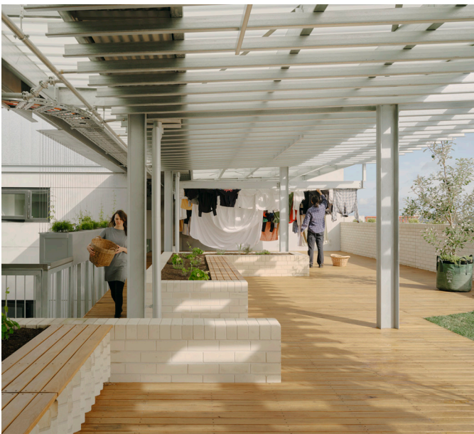
Image credits: Nightingale CRT + YRD (above) and Nightingale ParkLife and Evergreen (previous page).

Nightingale conducts post occupancy evaluation surveys with residents which is repeated after 3 months and 12 months. This provides insights into their experiences around the process and outcome which is used to inform future projects. The social value of one of the developments, CRT + YRD in Nightingale Village has also been assessed in collaboration with the Australian Social Value Bank. A report has also been conducted by RMIT exploring practitioner and resident perspectives of social mix at Nightingale Village.